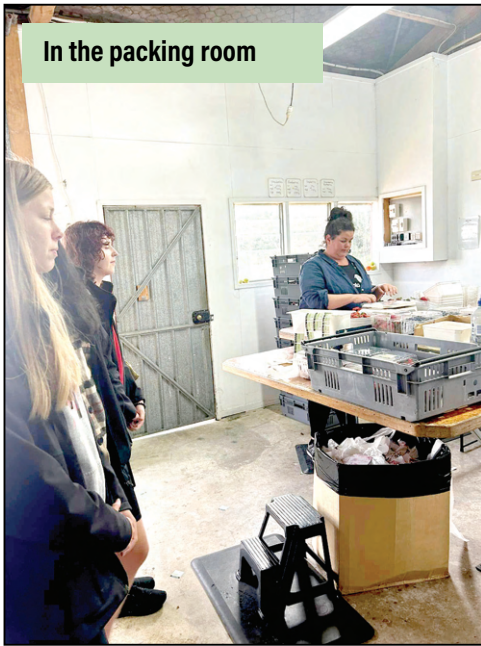
In the packing room